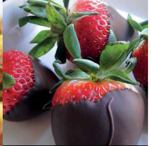
£5.25 PER PERSON

Smokies Park Hotel offers a selection of handmade canapés.